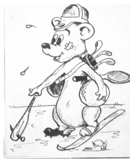
Male (ready for anything) Grizzly "Jock"

Queen Anne closed its doors in 1981. The new students at the new school will be choosing school colors and a mascot later this year.