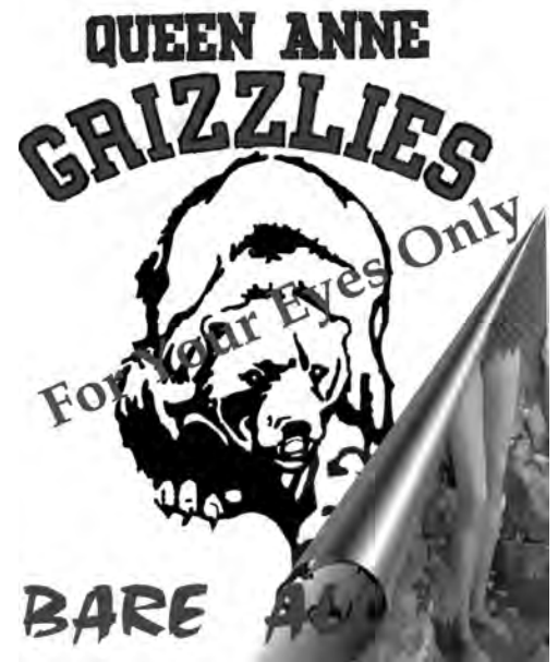
Class of 1954's "Calendar Girls" 2005 calendar, produced to raise money for QAHSAA scholarships.

Interestingly enough, the reunion committee is continually receiving requests from classmates who want to appear in future years' calendars.