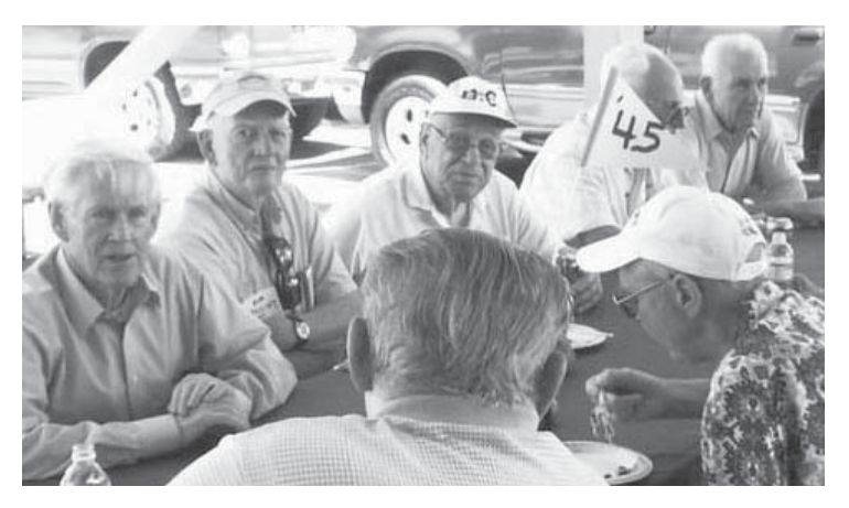
Classmates from the mid-1940s at the 2010 summer picnic.

The annual all-classes picnic held August 15 was back at Gas Works Park. It was a beautiful day, but very hot, so most of the Grizzlies were hiding undercover with the food.