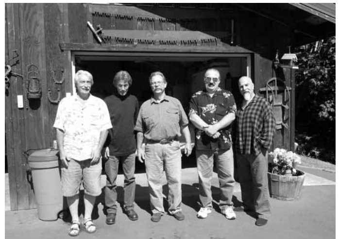
The Neurotics in 2014.