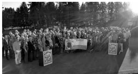
Class of '64 golden reunion.