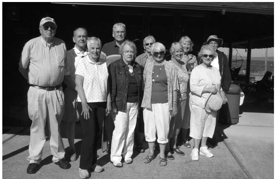
Class of '52 picnic. (See p. 4)