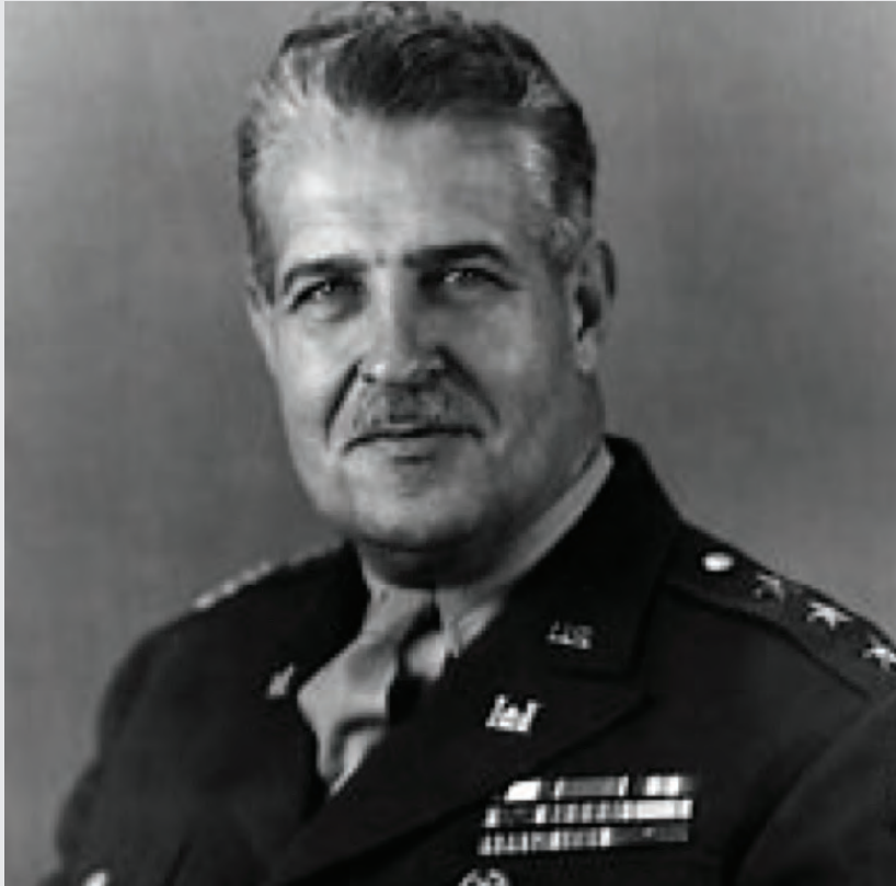
Leslie Richard Groves, Jr.