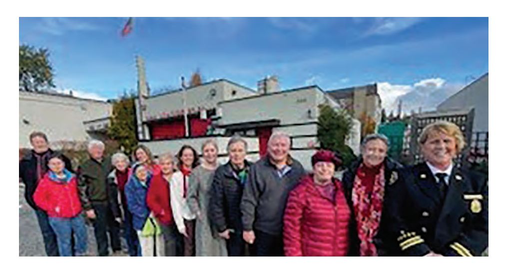
Who's News Magnolia Historical Society