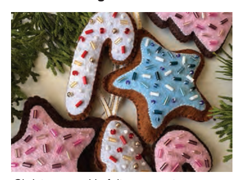
Christmas cookie felt ornaments

I worked a couple of makers markets this year as well for my small business, which were fun as always. (Local artisans sell their wares at "makers markets".) I expanded into some other art mediums as well, and made a lot of felt ornaments for the holidays which were a huge hit. I've also started making more embroidery pieces as well, and I've loved working with some new art mediums and expanding my creativity even more. If you're curious, please feel free to check out my work at linktr. ee/roxikodesigns